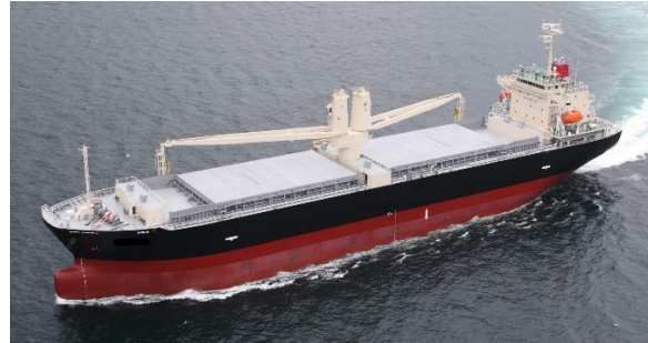
Image of hydrogen-powered ship

For further information, please contact: